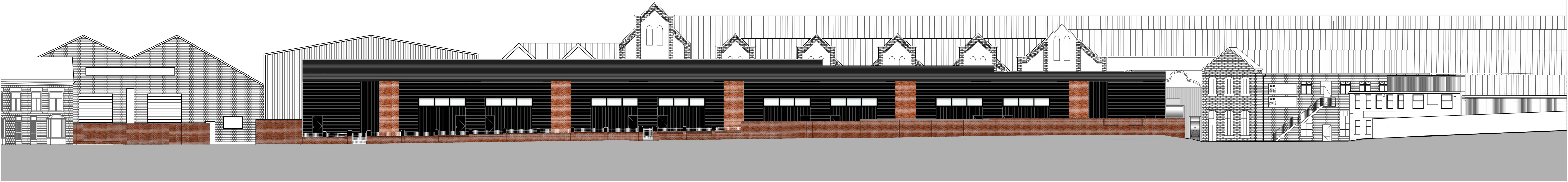
1 Proposed Street Context Elevation 1 : 200